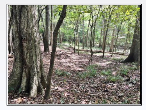
$2,185,000 MLS #126721