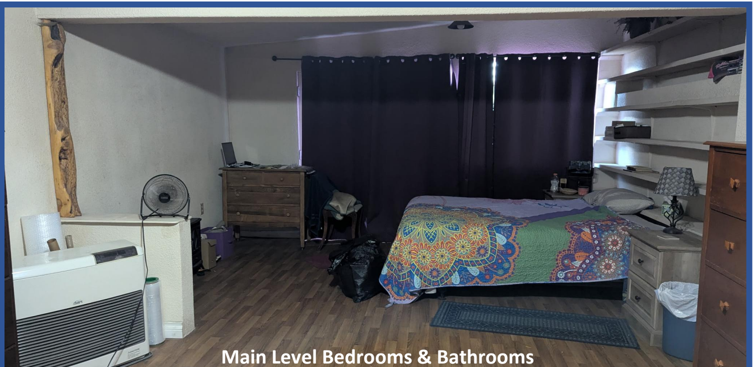
Main Level Bedrooms & Bathrooms