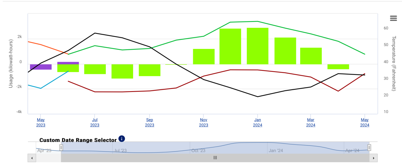
MONTHLY - May 2023 - May 2024