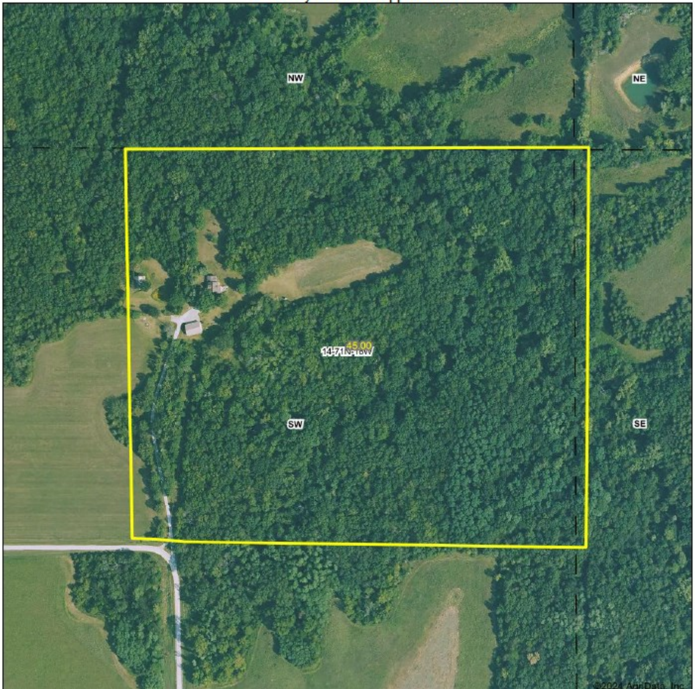
Aerial Map Boundary Lines Are Approximate