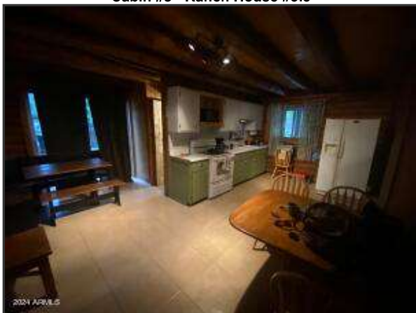
Ranch House - kitchen