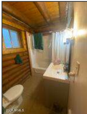
Ranch House - bathroom