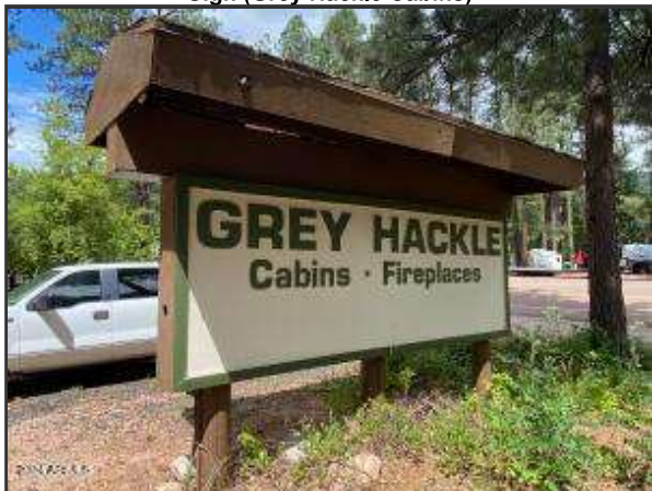
Sign (Grey Hackle Cabins)