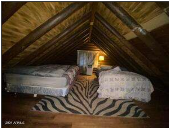
Ranch House - loft