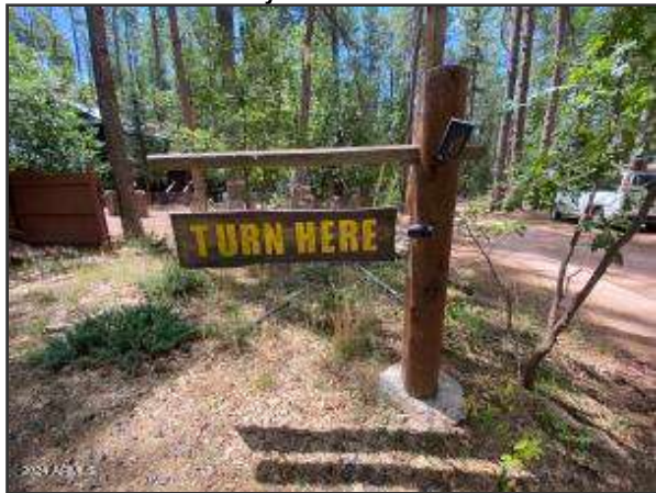
Driveway to cabins.