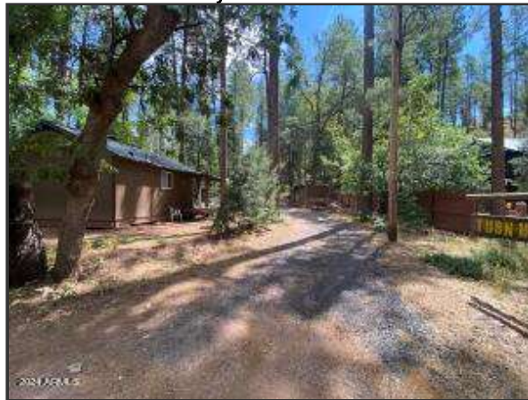
Driveway to cabins.