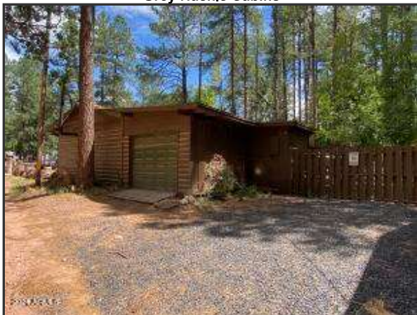
Side of office building, 1 car-garage.