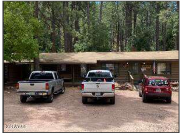
4 Office+Caretaker Quarters