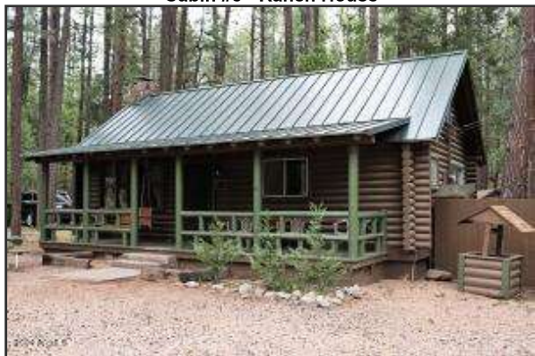
Cabin #8 - Ranch House

Ranch House: 2 pull-out sofas downstairs by the fireplace, two queen beds in the loft, full kitchen with stove, full size refrigerator/freezer, microwave, coffee maker, barbecue and a big shower. Front and back porch.