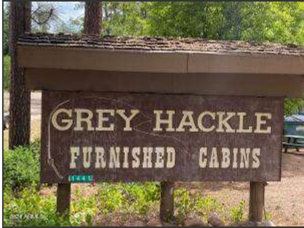
Grey Hackle Cabins

Discover the Grey Hackle Furnished Cabins at the Grey Hackle Lodge in Christopher Creek (Payson), Arizona.