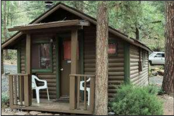
Cabin 2: STUDIO, Queen bed, bathroom with shower, kitchenette, coffee maker, a barbecue in front. It has a fireplace.