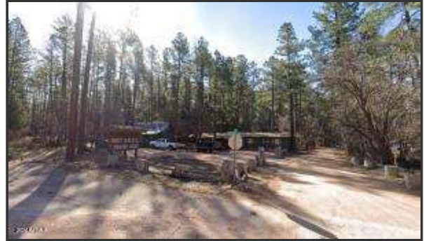
Street View (Grey Hackle Cabins)

1441 E CHRISTOPHER CREEK Loop, Payson, AZ 85541