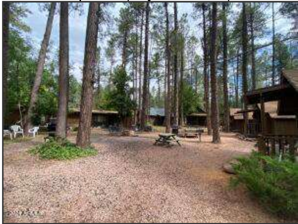
Open Area (Grey Hackle Cabins)

1441 E CHRISTOPHER CREEK Loop, Payson, AZ 85541