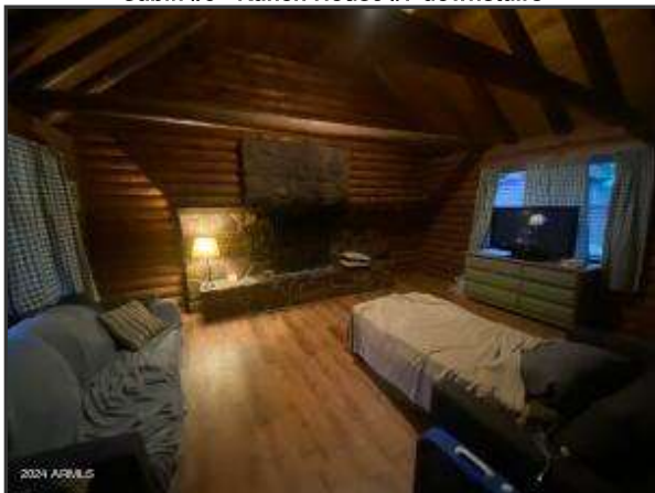
Ranch House - living room