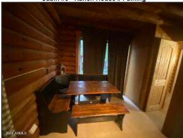
Ranch House - dining