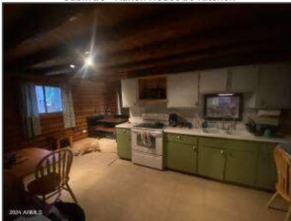
Ranch House - kitchen