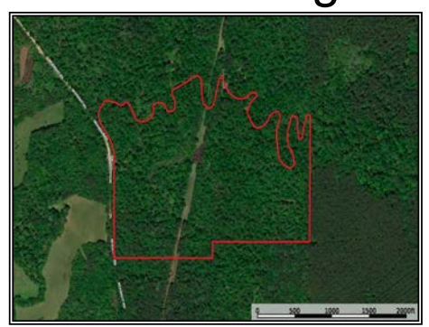
McKnight Road, Clarks, LA

Land For sale in Clarks, LA: a stunning 80+/acre parcel boasting a diverse mix of hardwoods. With over half a mile of McKnight road frontage and nearby utilities, this tract offers convenience and accessibility. Hurricane Creek divides the property, creating an ideal habitat for deer, turkey, and squirrel. A pipeline spanning from north to south facilitates excellent food plot placements, complemented by existing box stands for hunting. Just minutes from Columbia and less than an hour from Monroe, this property serves as an exceptional weekend getaway. A gate on the Southwest corner grants access to high ground, perfect for a potential campsite. The property underwent cutting in 2005, leaving one quarter of the property with mature hardwoods, while the remaining portion boasts 15+ year-old hardwoods, promising future income opportunities. THERE IS AN ADDITIONAL 120 ACRES NORTH OF HURRICANE CREEK THAT CAN BE PURCHASED WITH THIS PROPERTY AS WELL. Contact me to schedule a showing and secure your own slice of paradise today.