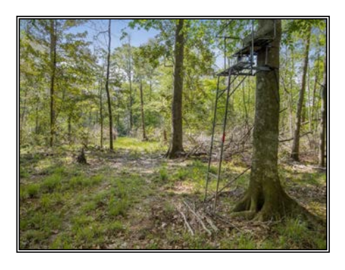
463± Acres MLS #141022