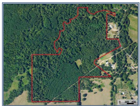
2157 Mt. Zion Road, Osyka, MS

85 acres of hunting land for sale on Bala Chitto Creek just north of the Louisiana Line in Southern Pike County MS. This recreational timber property features approx. 1/2 mile of creek frontage on a year round sandy bottom creek, mature hardwood timber consisting of large white oaks and various other oak species, and 17 year old planted pine. This is a great recreational hunting tract with food plots, superior internal road system and hardwood creek bottoms providing great habitat for whitetail deer and turkey. Property has paved road frontage, electricity and is easily accessed from I-55. It is located within an hour drive from New Orleans and Baton Rouge LA. Bala Chitto Creek offers great swim holes, fishing, and is a great fresh water source for wildlife. This is one of the nicest well kept land tracts for sale in South MS. Call us today for your tour of this trophy property for sale.