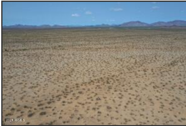
Point 7 NW