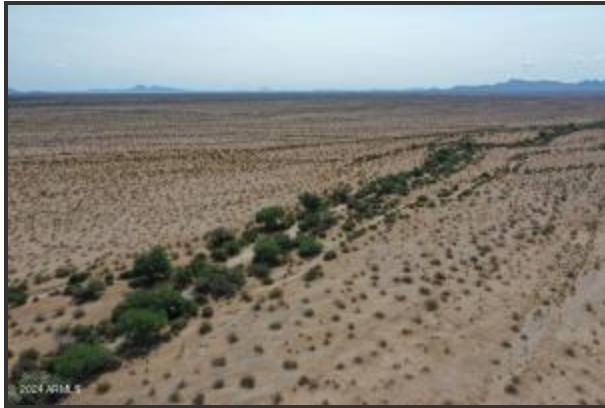
Point 7 SE