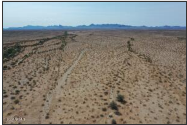
Point 7 S