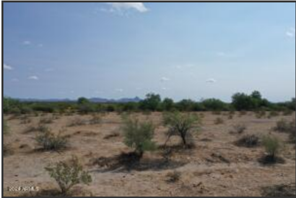
Point 7 10ft E