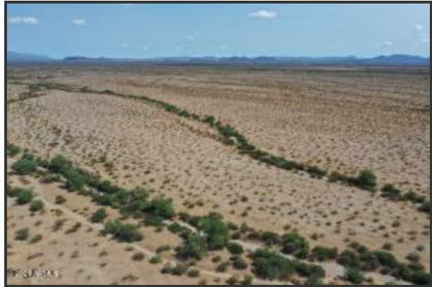
Point 7 NE