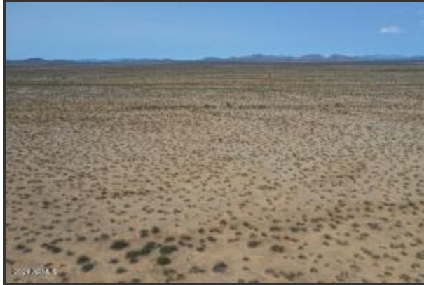
Point 7 W