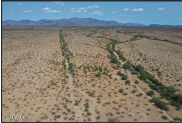
Point 7 N