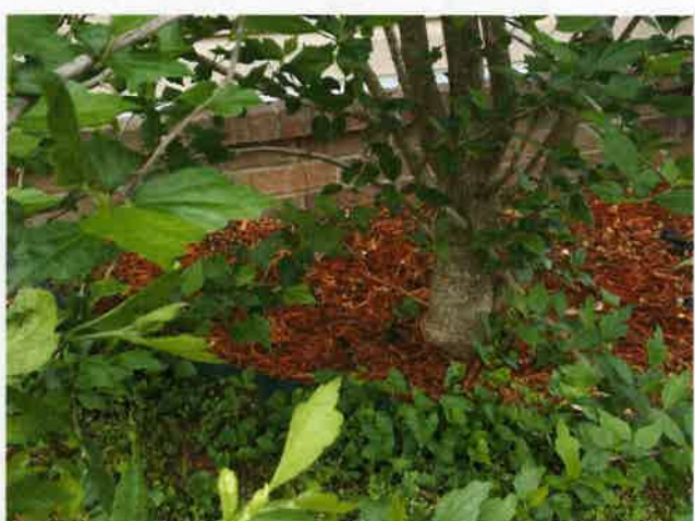
4 - 1