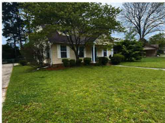
1 - 1