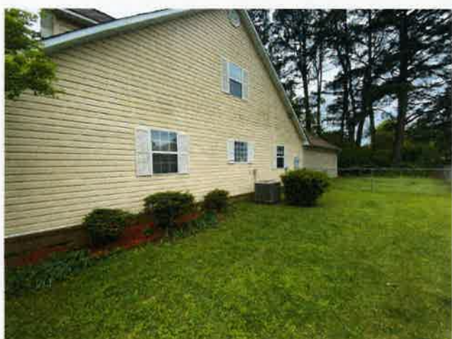
3 - 1