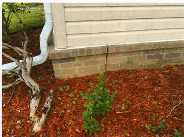
2 - 1