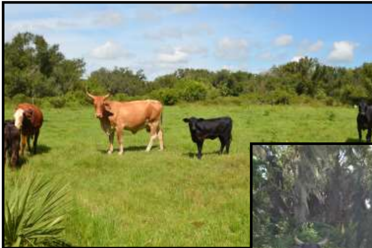
Cattle Grazing and Greenbelt taxes