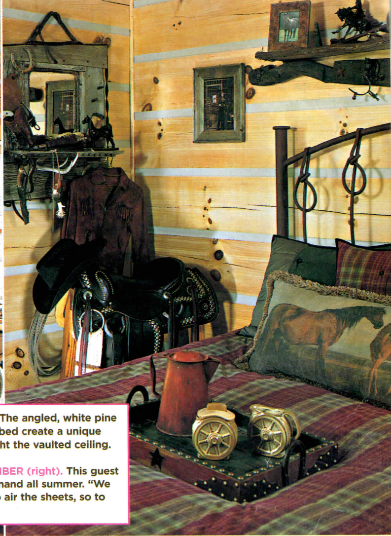
HIGH STYLE (left). The angled, white pine boards behind the bed create a unique pattern and highlight the vaulted ceiling.