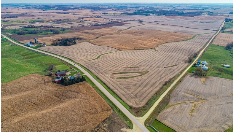
View: Looking South East