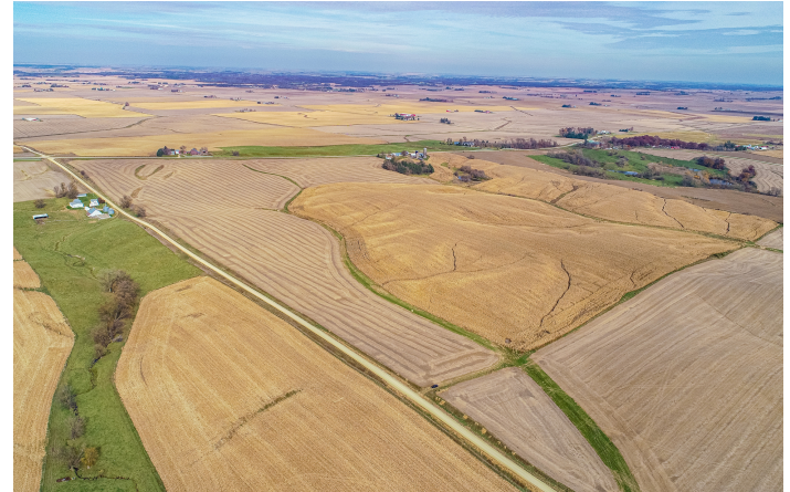
View: Looking North East