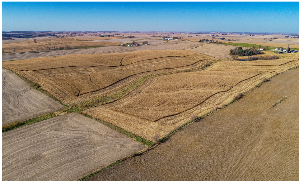
View: Looking North West

BRET BARNER, BROKER/AUCTIONEER (319) 462-4100 or (319) 480-2124