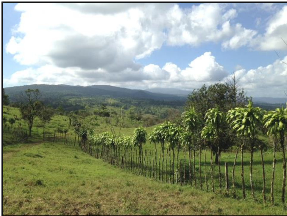
INTERIOR VIEW OF RANCH