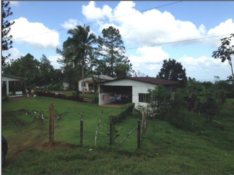
VIEW OF HOMES ON PROPERTY