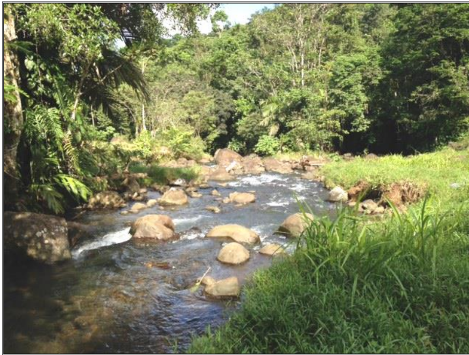
VIEW OF RIO COTE FACING NORTH