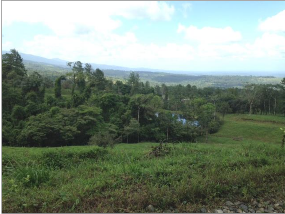
VIEW OF PROPERTY FACING WEST FROM GUATUSO ROAD