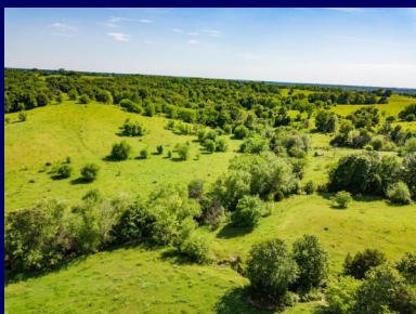
Boundary 131.5 ac