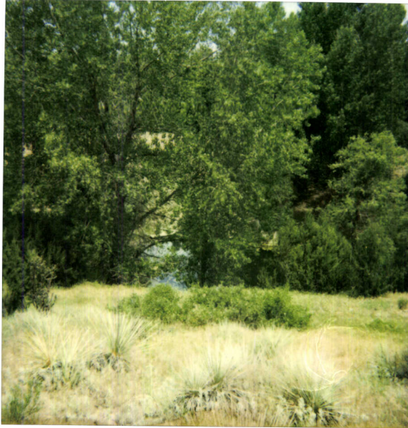
1505031 PICTURE TAKEN FROM RIDGE 6-18-01 FACING NW LOUIS FASS 1 CF 2