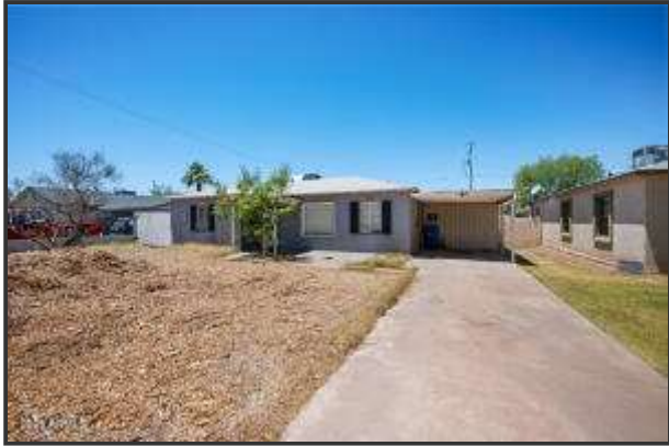
2002 N 25TH Street, Phoenix, AZ 85008