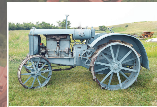
1928 Twin City 17-28