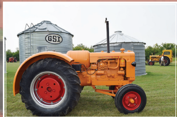
1958 MM GB