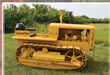
1934 Caterpillar Model 28