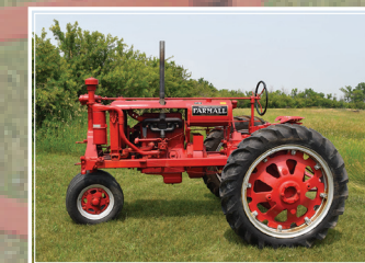
1939 McCormick Deering Farmall F-20