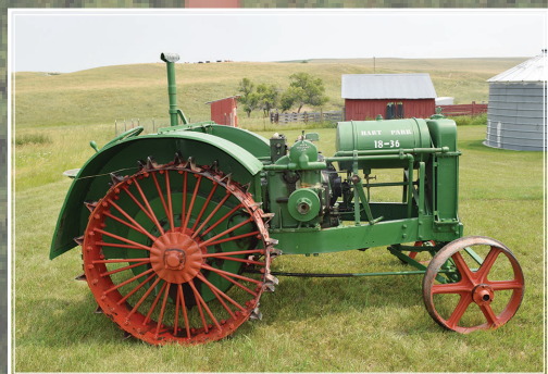
1928 Hart Parr 18-36