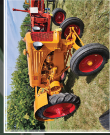
1940 MM RTS