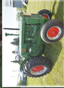
1948 Oliver 99