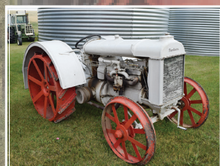
1927 Fordson Model F