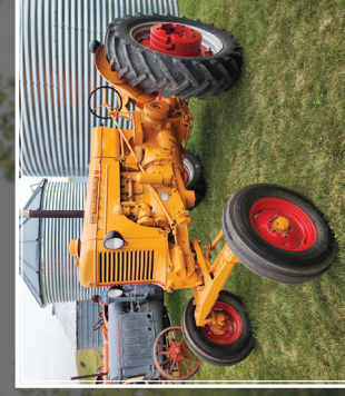
1951 MM Model UTE