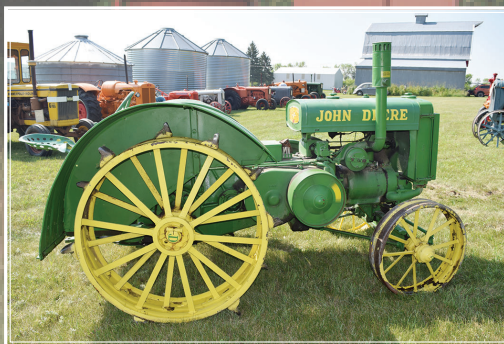
1928 John Deere D