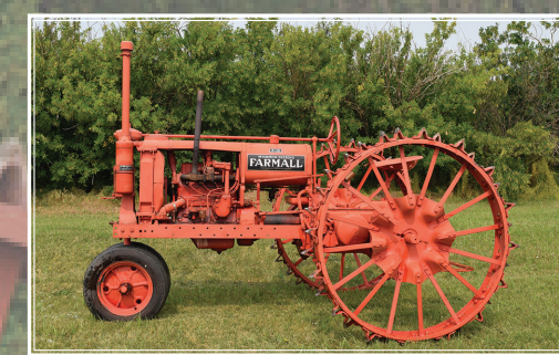
1936 McCormick Deering Farmall F12