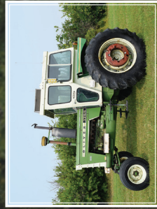
1975 Oliver 1755