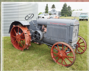
1926 McCormick Deering 10-20