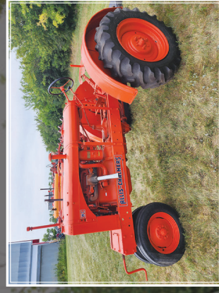
1937 Allis Chalmers WC