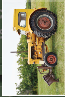
1957 MM GB