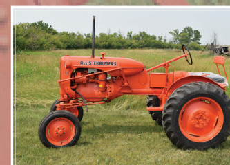
1945 AC Model C