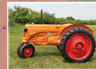
1948 MM Universal ZTU