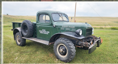
1950 Dodge Power Wagon