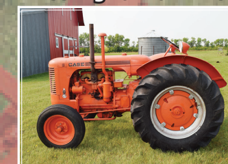
1941 Case S