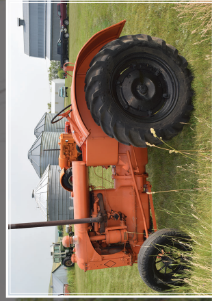
1937 Allis Chalmers Model U