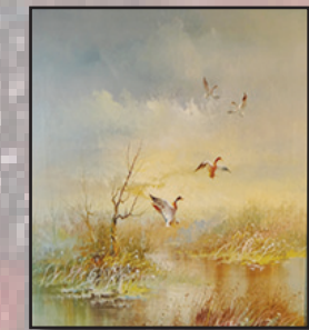
B. Dorsey Mallards Incoming