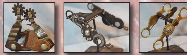
Crockett Crescent Silver Mtd Hercules Bronze