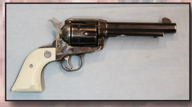
Ruger Vaquero, .44 Mag

SATURDAY, OCTOBER 30, 2021 9:00 A.M. (MDT) ♦ Trade Center, Fairgrounds, Lewistown, MT Preview: Friday, Oct. 29th, 1:00 - 7:00 P.M. • Live Auction with Internet Bidding Available