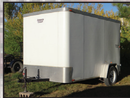
2006 Dakota Coach