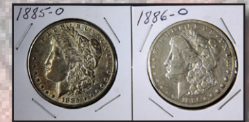
Morgan Dollars - 2 of 50

SATURDAY, OCTOBER 30, 2021 9:00 A.M. (MDT) ♦ Trade Center, Fairgrounds, Lewistown, MT Preview: Friday, Oct. 29th, 1:00 - 7:00 P.M. • Live Auction with Internet Bidding Available