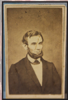
Abe Lincoln orig.