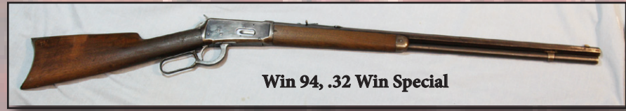
Win 94, .32 Win Special