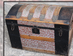
Steamer Trunk 1 of 6