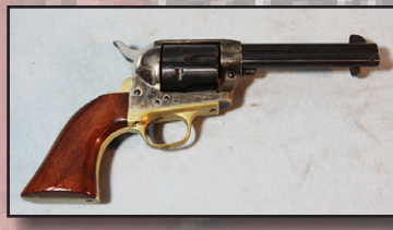
Uberti Colt SAA, .45 Long Colt