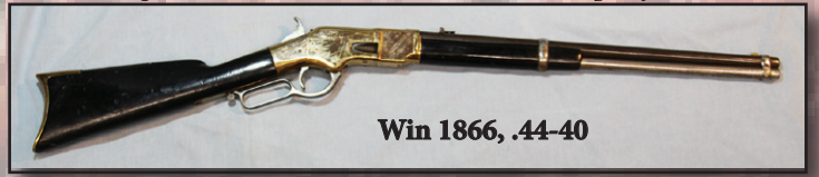
Win 1866, .44-40