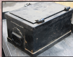
Stage Coach Strong Box