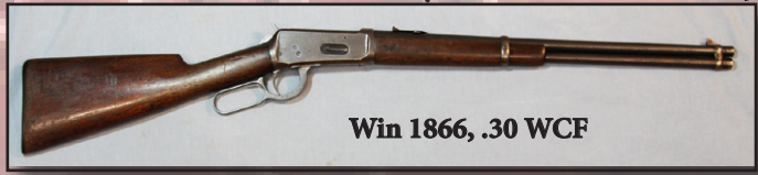
Win 1866, .30 WCF