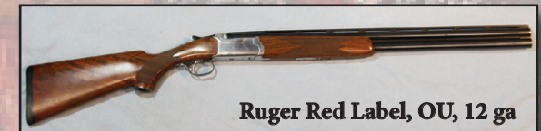
Ruger Red Label, OU, 12 ga