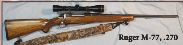
Ruger M-77, .270