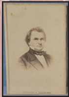
Stephen A. Douglas orig.