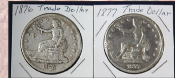
U. S. Trade Dollars - 2 of 4