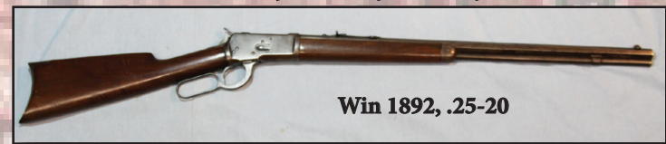
Win 1892, .25-20