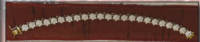
Diamond Tennis Bracelet