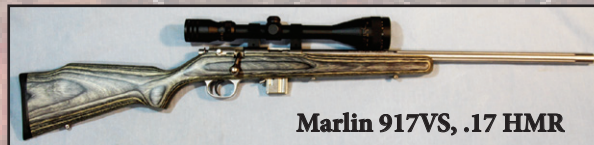
Marlin 917VS, .17 HMR