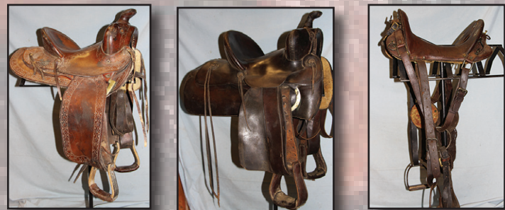
Pat Connolly Al Furstnow McClellan