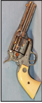
Colt SAA. .45 Long Colt

408 West Main Street Lewistown, MT 59457