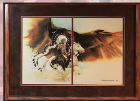
Bev Dolittle print