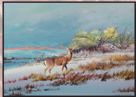
Clarence Cuts the Rope oil