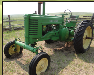
1949 JD A