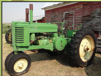
1947 JD G