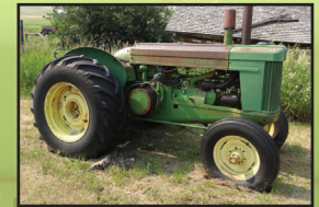
1938 JD A