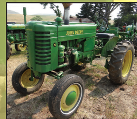
1949 JD M