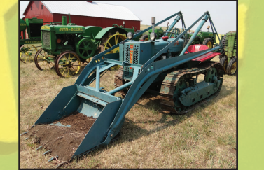
1948 Oliver Cletrac HG