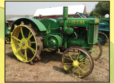
1926 JD Spoker D