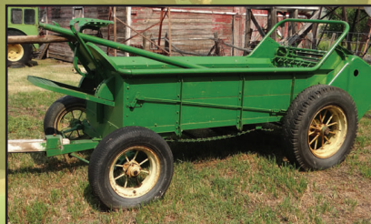
JD Manure Spreader