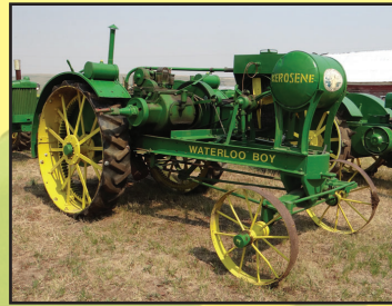
1920 JD Waterloo Boy N