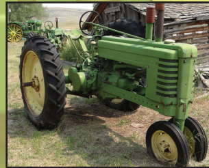
1945 JD B