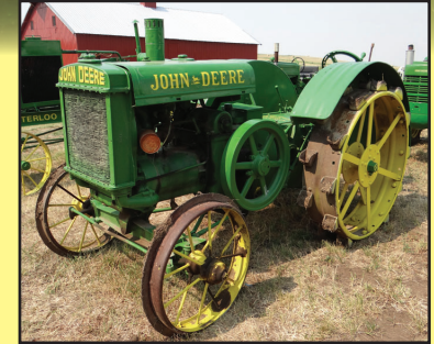
1926 JD Spoker D