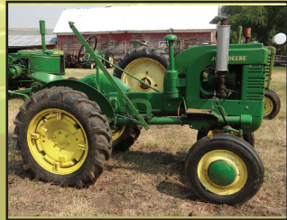
1945 JD LA Peanut Planter