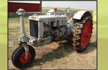
1936 Case RC