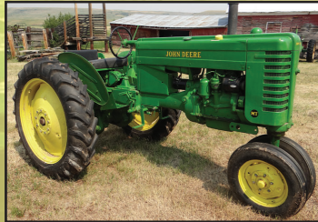
1951 JD MT