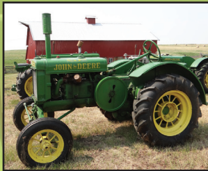
1929 JD GP