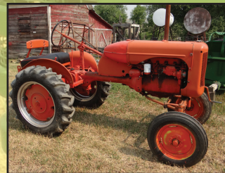
1947 Case C