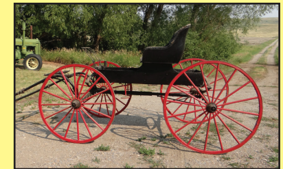
Single Seat Buggy

THURS., SEPT. 30 TH , 2021 • 10:00 A.M. (MDT)