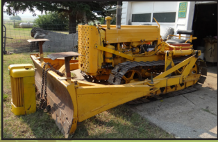
1956 JD 420

OWNERS: Robyn Mehmke, Great Falls, MT Ph. 406-788-5817 & Aimee Wood, Belt, MT Ph. 406-788-1450