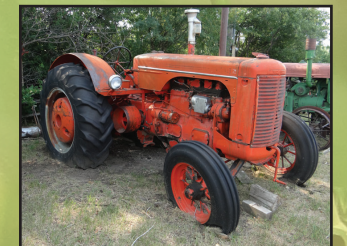
1950 Case LA