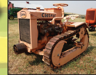
1922 Cletrac Model F