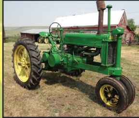
1938 JD A