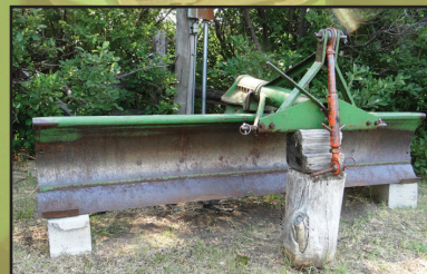
JD Model 80 3 pt blade