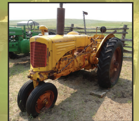
1949 MM ZTU-RE