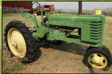
1940 JD H