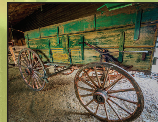
JD Freight Wagon