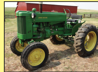
1955 JD 40