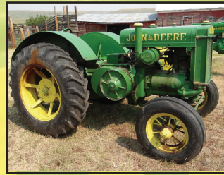
1926 JD D