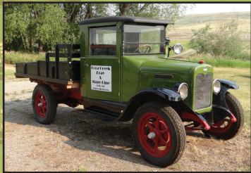
1926 IHC 6-spd