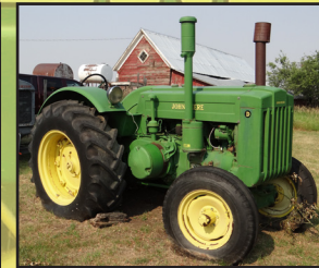
1945 JD D