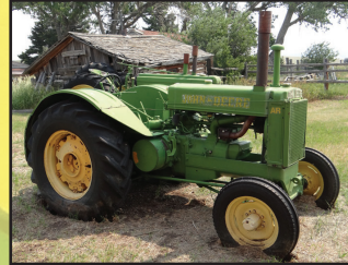
1943 JD AR