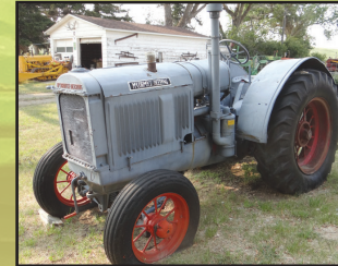
1929 McCormick Deering