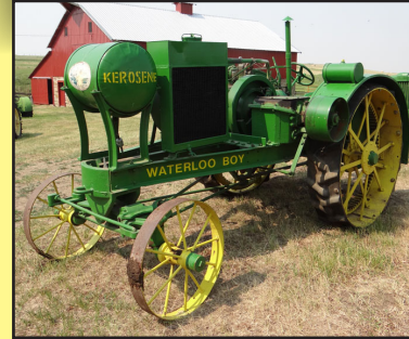
1920 JD Waterloo Boy N