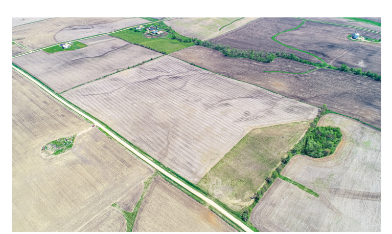
View: Looking North West