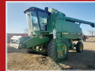
1994 JD 9600