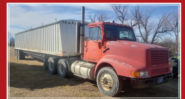
1992 IHC Navistar 8200 & 1994 Jet, 42'