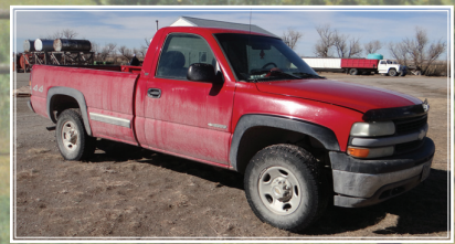
1999 GMC 2500 Silverado