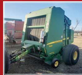
2009 JD 568 MegaWide Plus