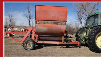
Highline 6800 Bale Pro