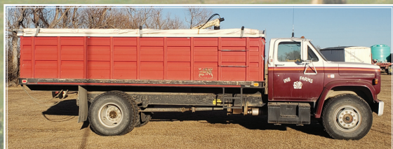
1984 GMC 7000, 18' box