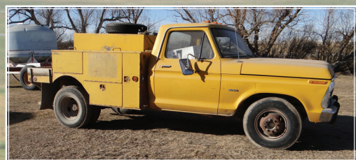
1974 Ford F-350

Auction Location: 920 23rd Road NW, Choteau, MT (11.3 miles N. of Choteau)