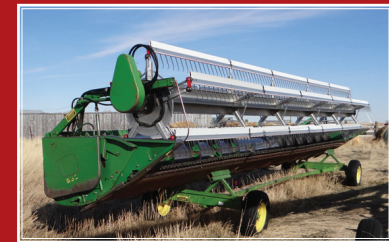
JD 930, 30' & transport