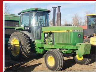
1991 JD 4755