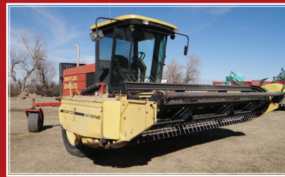
1997 NH 2450, 14'

From Conrad, go south on Main Street for 1 mile, then SW on Hwy. 219 (Pendroy Rd) for 11.6 miles, then south on Hwy. 220 for 9 miles, then west on 23 rd Rd NW for 1.3 miles. Watch for auction signs.