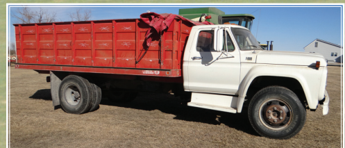
1975 Ford F700, 15.5' box