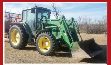
1999 JS 6410 w/ JD 640 Loader