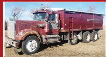
1980 Western Star, 20' box