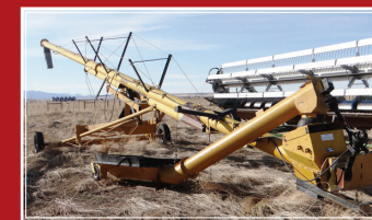
Alloway, 10' x 66'