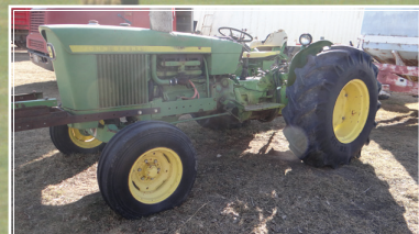
1975 JD 2030