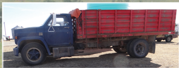
1973 Chevy C60, 20' box