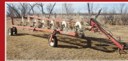
H & S Hi-Capacity