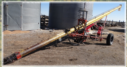
Westfield W-70, 7" x 70'