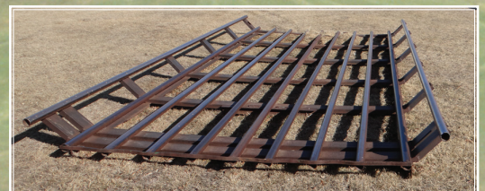
Bale Rack, 20'