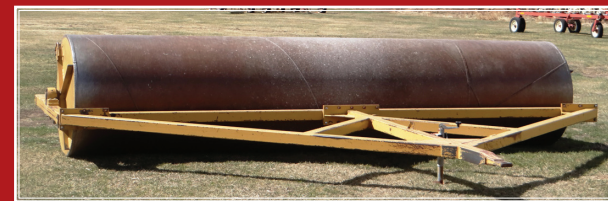
18' Land Roller