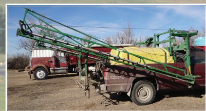
Summers, 50' booms