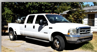
2000 Ford F350 Truck Diesel - Dually - Runs