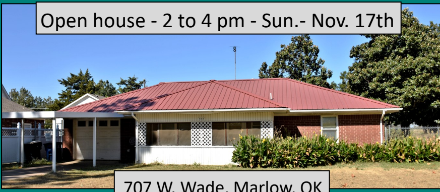
707 W. Wade, Marlow, OK

Open house - 2 to 4 pm - Sun.- Nov. 17th