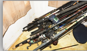
Nice Fishing Rods & Reels 30 plus of them Several Rifles & Shotguns 2 Bedroom Suites 3 Sec. Entertainment Center