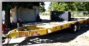
Big Tex Backhoe Trailer 2 Axle- Fold Down Ramps Gun Safe - In good Shape Welding Table with Vice Treadmill Exerciser