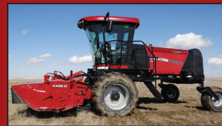
2005 Case IH WDX 2302