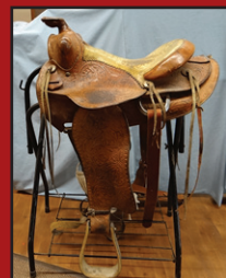
Hereford Tex Tan

First Class Mail Auto US Postage Paid Lewistown MT Permit 181