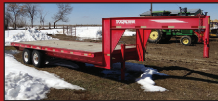
1998 Travalong, 20'