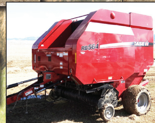
2010 Case IH RB564