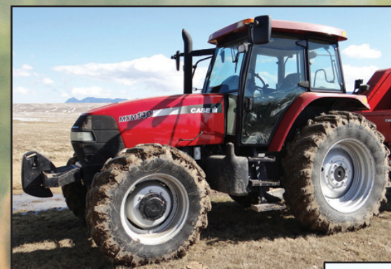
2005 Case IH MXM 140

Driving Directions: From Lewistown, go 15 miles north on US 191 through Hilger and turn north on Roy Junction Road, go 1.75 miles and turn left on Knapp Lane, then 0.5 mile to Auction Site.