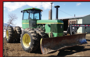
1975 John Deere 8430