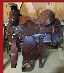
15" Stock Saddle