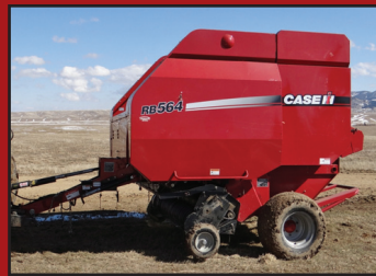
2010 Case IH RB564