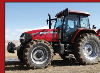
2005 Case IH MXM 140