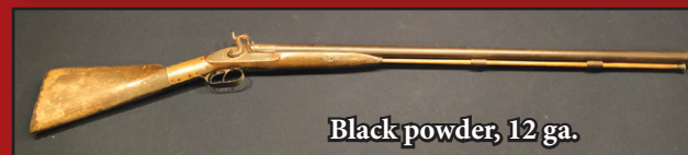
Black powder, 12 ga.