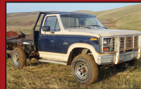
1985 Ford F-250 w/ Hydrabed