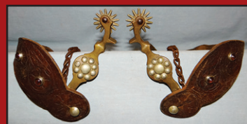
Buermann Hercules Bronze