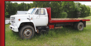
1973 Ford 600