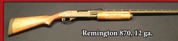
Remington 870, 12 ga.