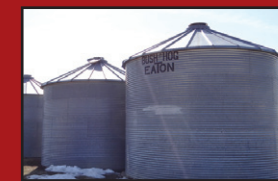
Eaton (2 of 4)