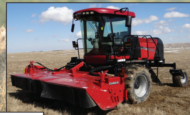
2005 Case IH WDX 2302