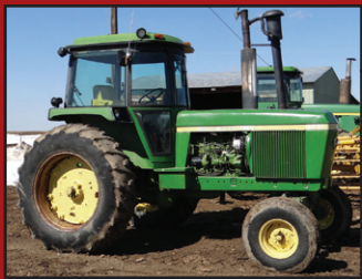
1973 John Deere 4430