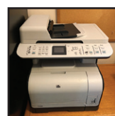
HP Color Laser Jet