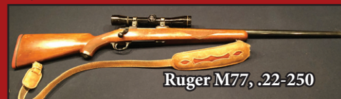
Ruger M77, .22-250