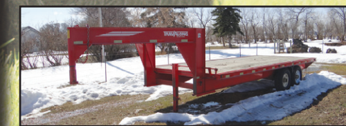
1998 Travalong, 20'