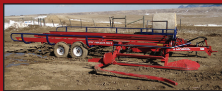
Morris Hay Hiker 881

Driving Directions: From Lewistown, go 15 miles north on US 191 through Hilger and turn north on Roy Junction Road, go 1.75 miles and turn left on Knapp Lane, then 0.5 mile to Auction Site.