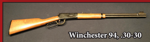
Winchester 94, .30-30