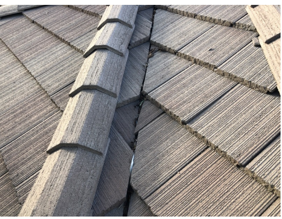
Debris in valley