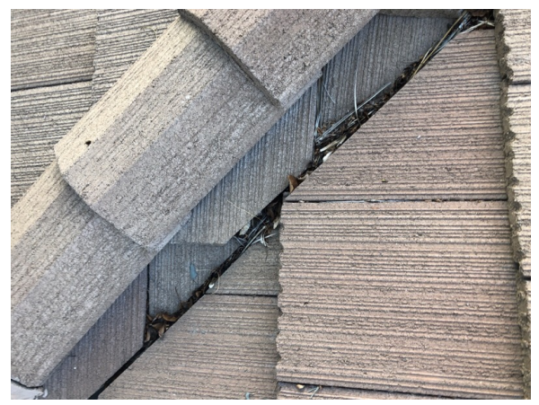
Debris in Valley