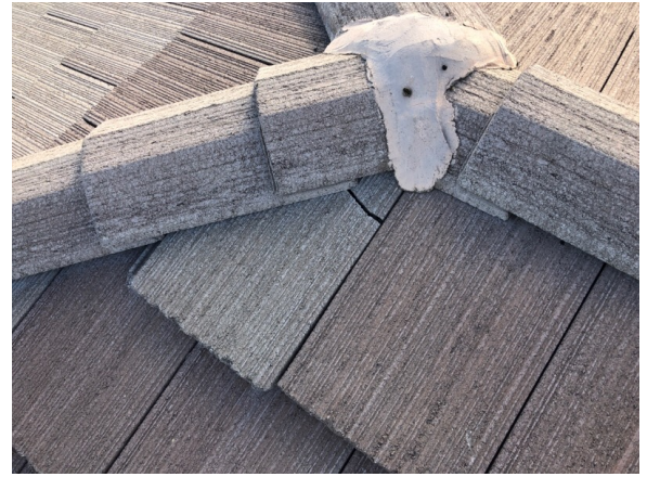
Broken mortar pack and tile