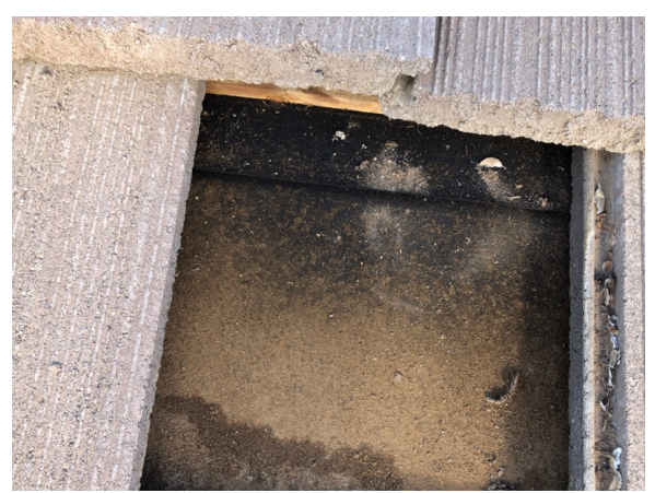
Underlayment is in satisfactory condition