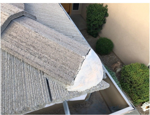
Broken mortar pack n/a Take pictures and identify roof leak.

I did not find any signs of roof leaks during my inspection.