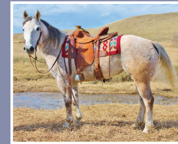
Tess 5 yo AQHA Mare

Check the website for additional consignments!