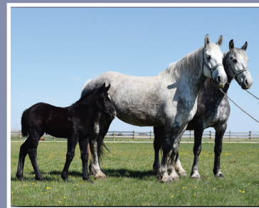
Jill & Janet 7/8 yo Percheron Mares w/ foals