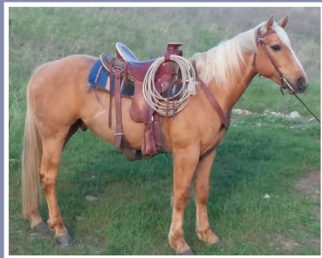
CJ Jakes Rancher 5 yo AQHA Gelding