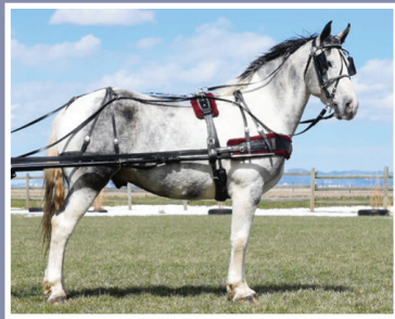
Checkers 5 yo Qh x Percheron Gelding