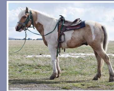
Dollar 10 yo Pony Gelding