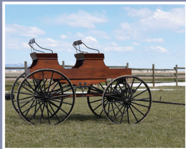
Two Seat Buckboard