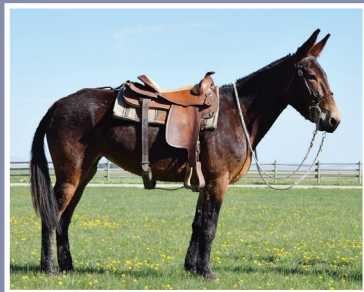
Daisy 8 yo Molly Mule