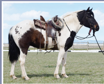
Bingo 8 yo Spotted Draft Cross Gelding