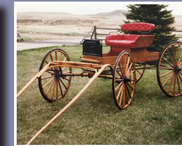
Single Seat Buggy