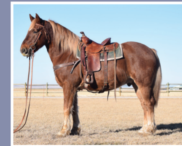
Colonel 10 yo Belgian x Morgan Gelding