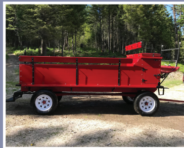
Pioneer Draft Wagon