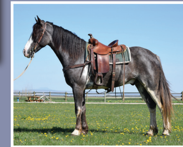
Blazer 4 yo Shire Cross Gelding