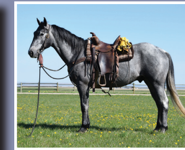
Champ 6 yo QH Gelding