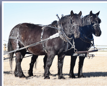
Tom & Toots 10/11 yo Perch x Half Geld/Mare