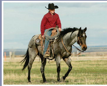
Fancy 4 yo AQHA Mare