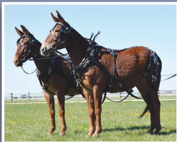
Sadie & Sally 8/10 yo Molly Mules