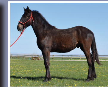
Yearling Stud Colt 1 yo Percheron x Standardbred