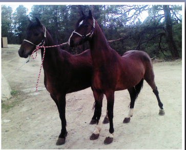
Billy & Belle 7/6 yo Hackney Pony Geld/Mare