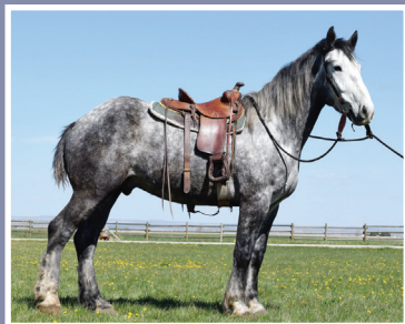
Jasper 6 yo Percheron Gelding