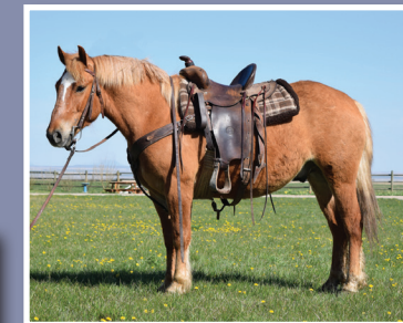
Bubba 4 yo Halflinger Gelding