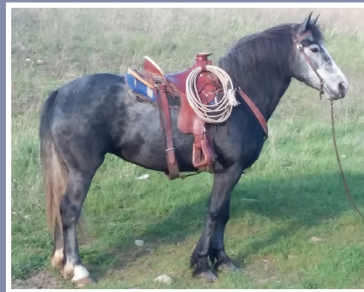
Nellie 4 yo Draft Cross Mare