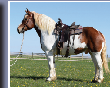
Dusty 5 yo Belgian x Paint Gelding