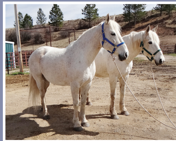
Doc & Duke 13/12 yo Perch x QH Geldings