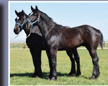
7/8 Brothers 2 yo Percheron Geldings