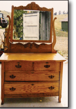
Oak Serpentine Dresser