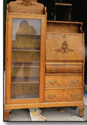
Oak Secretary/China Cabinet