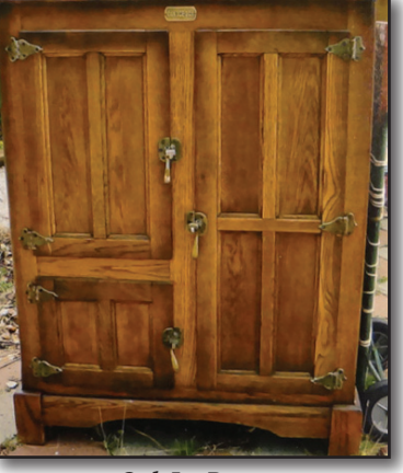
Oak Ice Box