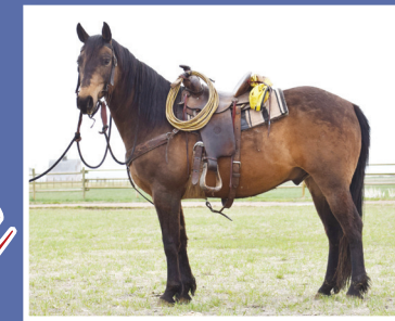
Peppy 8 yo QH Gelding