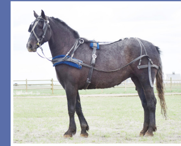
Reba 3 yo Perch/Morgan Mare