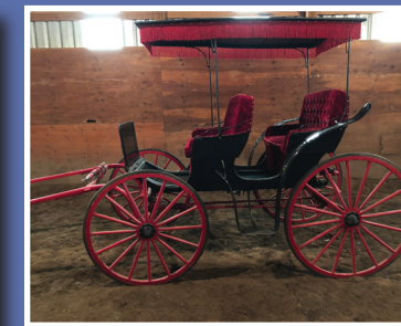
Fringe Top Surrey