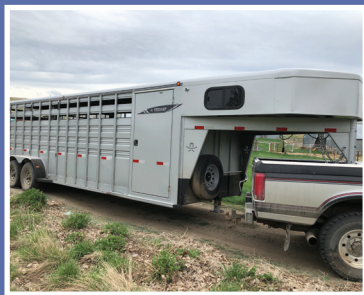
2014 Titan 24'