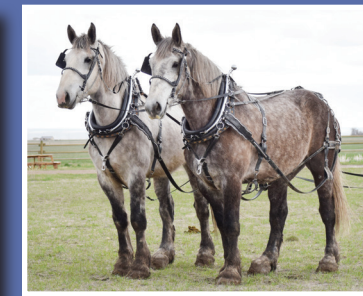
Matt & Jeff 5/6 yo Percheron Geldings