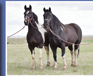
Fan & Flicka 9 yo Paint Mares