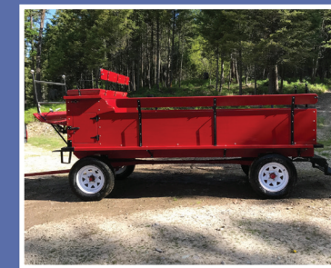
2010 Pioneer Draft Wagon