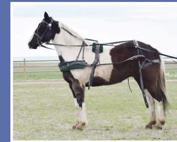
Pepper 8 yo Paint Mare