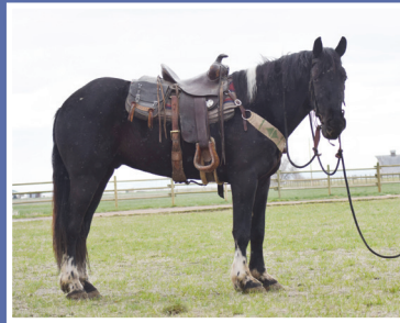
Sonny 3 yo Perch/Paint Gelding