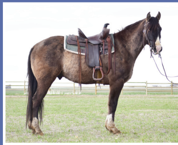
Ace 9 yo QH Gelding