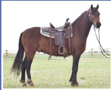
Rocket 3 yo Morgan/Halfinger Geld