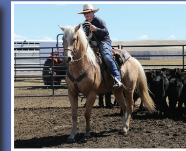
Hooley 4 yo AQHA Gelding