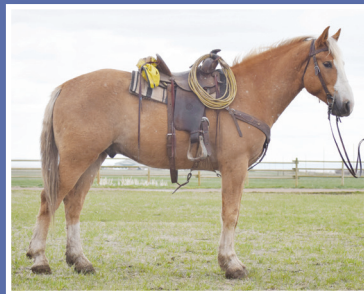
Chester 5 yo Belgian/QH Gelding