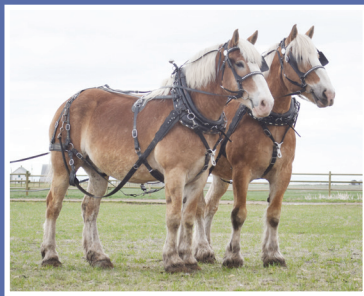
Prince & Peter 9 yo Belgian Geldings