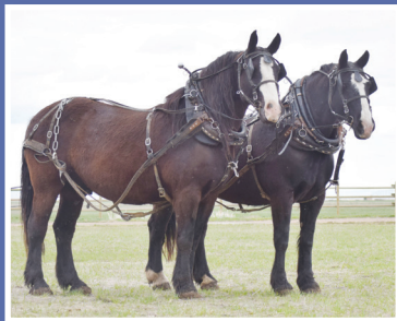
Dick & Dolly 10 yo Percheron Mare/Gelding