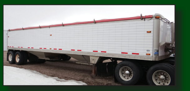
2006 Timpte, 40' aluminum