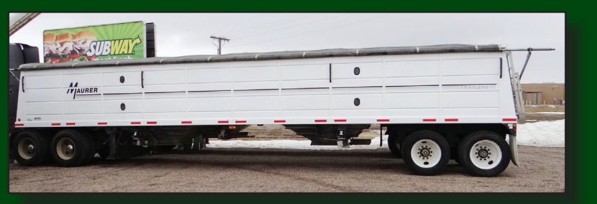
2012 Mauer, 42' steel