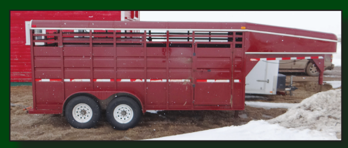
1998 Circle D, 16'