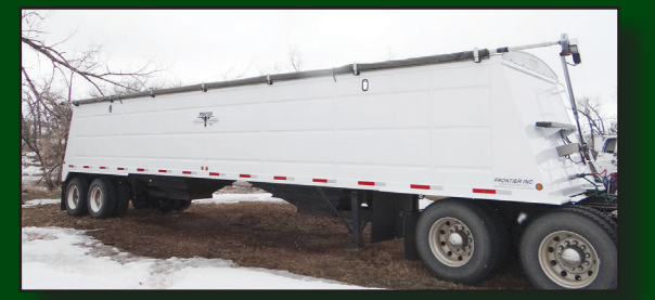
2014 Frontier, 40' steel