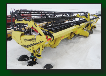
2017 Honey Bee Air Flex 240, 42'