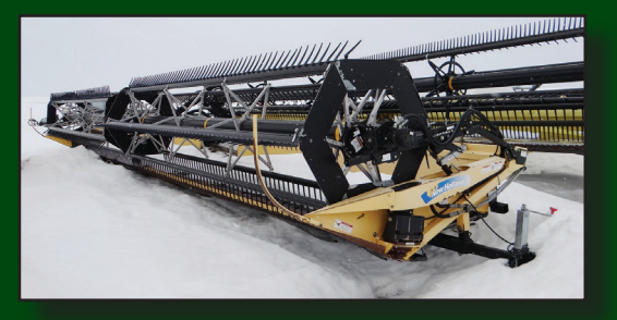
2012 NH 94C, 42'