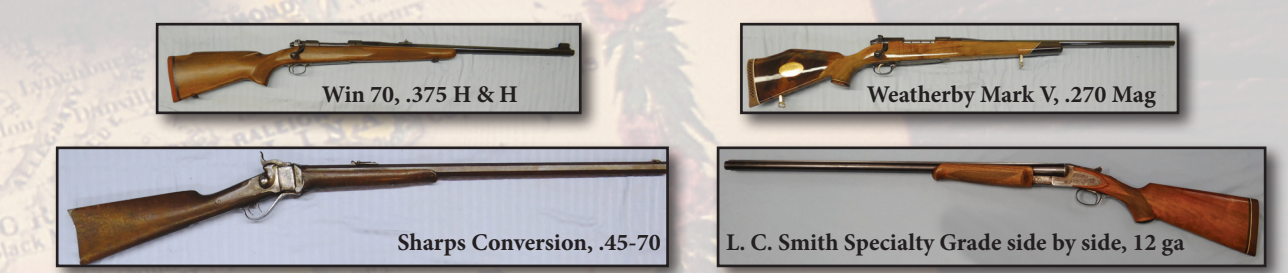
Win 70, .375 H & H