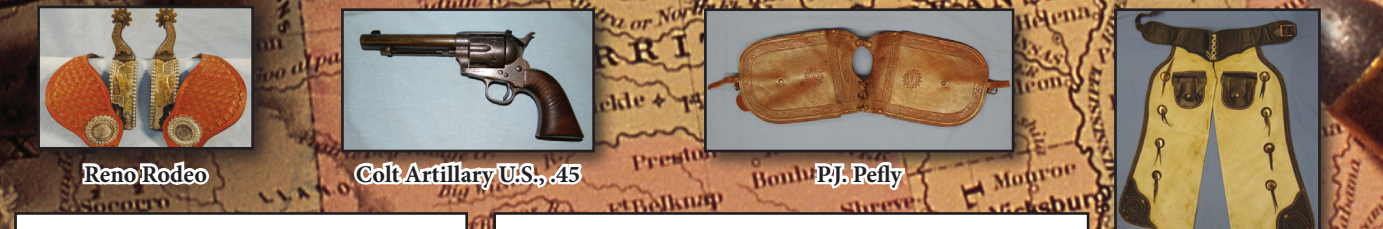
Reno Rodeo Colt Artillery U.S., .45 Heiser-style

Terms: 10% Buyer's Premium. Cash, check or credit card day of auction. If paying with a credit card, buyer's premium is 15%. Separate terms apply for online bidding; see website for details. All FFL regulations will be complied with.