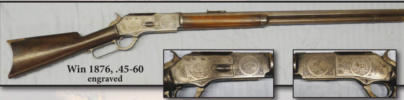
Win 1876, .45-60 engraved