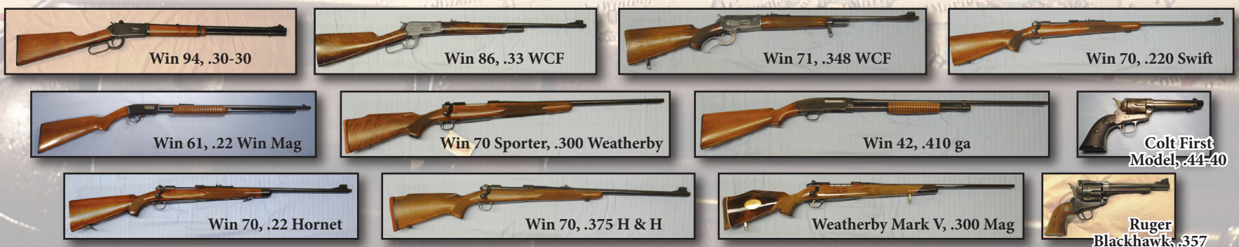
Win 94, .30-30 Win 86, .33 WCF Win 71, .348 WCF Win 70, .220 Swift Win 61, .22 Win Mag Win 70 Sporter, .300 Weatherby Win 42, .410 ga Colt First Model, .44-40 Ruger Blackhawk, .357