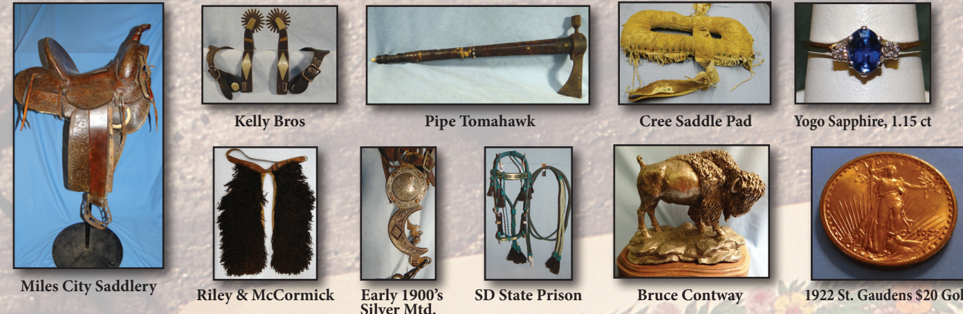
Miles City Saddlery Kelly Bros Pipe Tomahawk Cree Saddle Pad Yogo Sapphire, 1.15 ct