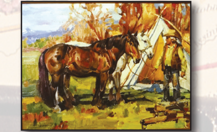
Gary Schildt oil - Work Team in Camp

408 West Main St. Lewistown, MT 59457 Office: 406-538-5125