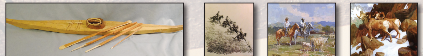
Toy Kayak, wood & ivory oars