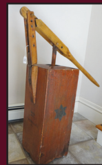
Atomic Butter Churn