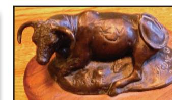
J.C. Dye - Moose