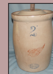
RW 2 gal Churn