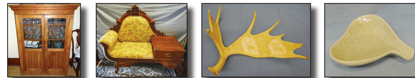
Mahogany Oak Ice Box Walnut Pine China Cabinet Walnut Telephone Settee

Friday, Oct. 6 th & Saturday, Oct. 7 th , 2017 Auction begins at 5:30 P.M. on Friday & 10 A.M. on Saturday LOCATION: TRADE CENTER, FAIRGROUNDS • LEWISTOWN, MT