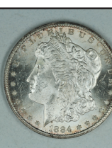
1884 CC Morgan