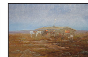
C.R. Cheek - The Big Dipper