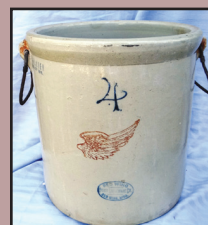
RW 4 gal