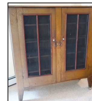
Walnut Pie Safe

Friday, Oct. 6th & Saturday, Oct. 7th, 2017 Auction begins at 5:30 P.M. on Friday & 10 A.M. on Saturday LOCATION: TRADE CENTER, FAIRGROUNDS • LEWISTOWN, MT