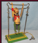
Tin Windup Toy