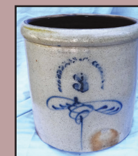
RW 3 gal drop 8 Salt Glaze