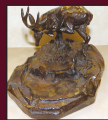
C.M. Russell - An Awkward Situation