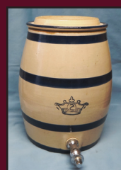
Crown 2 gal