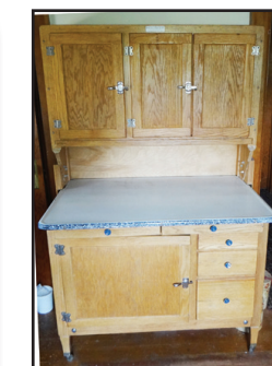
Hoosier Kitchen Cabinet