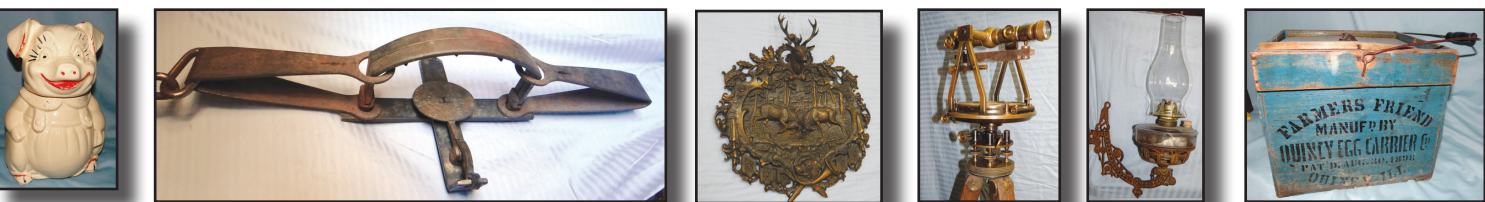
Cookie Jar Hudson Bay Kodiak Bear Trap Cast Iron Gurley Transit Kerosene Lamp Quincy Egg Crate 1897 Morgan 1890 S Morgan 1854 S $1 1926 $2.5 1884 S Morgan 1905 S $5 Plains Indian Cookie Jar