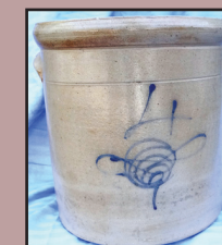
RW 4 gal drop 8 Salt Glaze