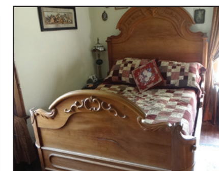
Hardwood Sleigh Bed