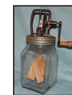
Dazey 2 qt