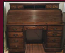
Oak Rolltop Desk