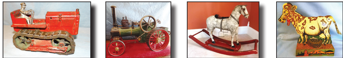
Arcade Crawler Toy Steam Engine Vintage Rocking Horse Tin Toy Milk Cow