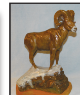
C.R. Cheek - Big Horn Sheep