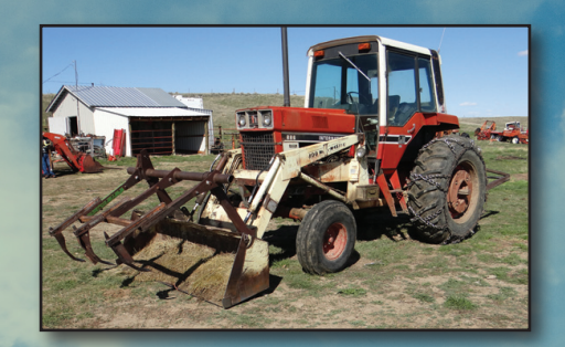
IH 886 w/ 800 Workmaster