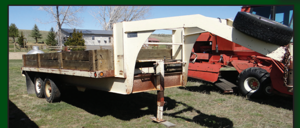
1980 NorwesTrailer 16'