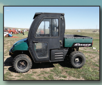
2007 Polaris Ranger 500