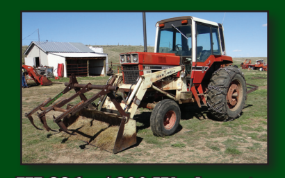
IH 886 w/ 800 Workmaster