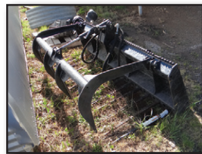
JD GU78 Grapple