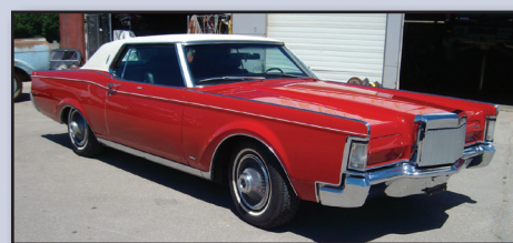
1969 Lincoln Continental Mark III