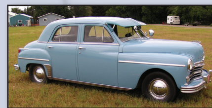
1949 Plymouth Special Deluxe