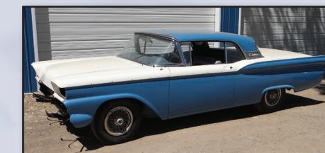
1959 Ford Skyliner