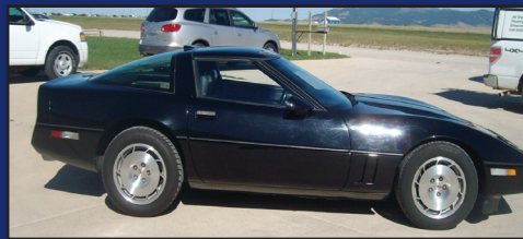
1986 Chevrolet Corvette