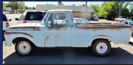
1961 Ford F100