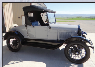
1927 Ford Model T Roadster