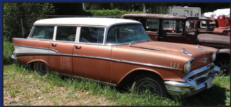
1957 Chevy BelAir Wagon