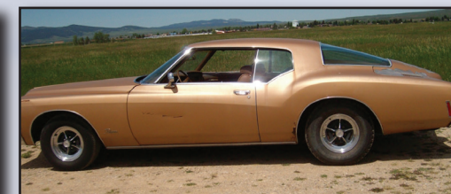
1971 Buick Rivera