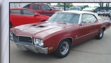
1970 Buick Grand Sport