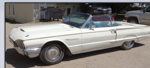
1964 Ford Thunderbird