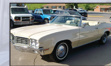
1970 Buick Skylark