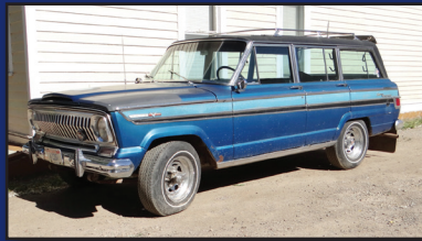
1968 Jeep Super Wagoneer