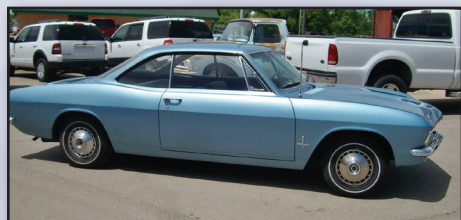
1965 Chevy Corvair Monza