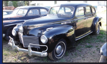
1940 Chrysler New Yorker