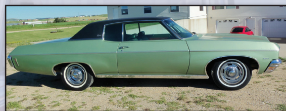
1970 Chevy Caprice