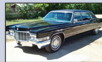
1969 Fleetwood 75 Limo