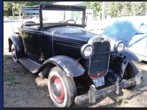
1930 Ford Model A

Saturday, August 13 th , 2016 10:00 A.M.