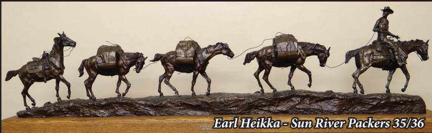
Earl Heikka - Sun River Packers 35/36