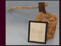
CM Russell Chopping Block