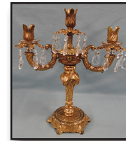
Brass & Crystal