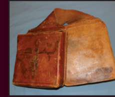
Dr. Saddle Bags