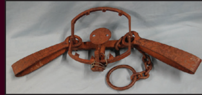
Hand forged bear trap