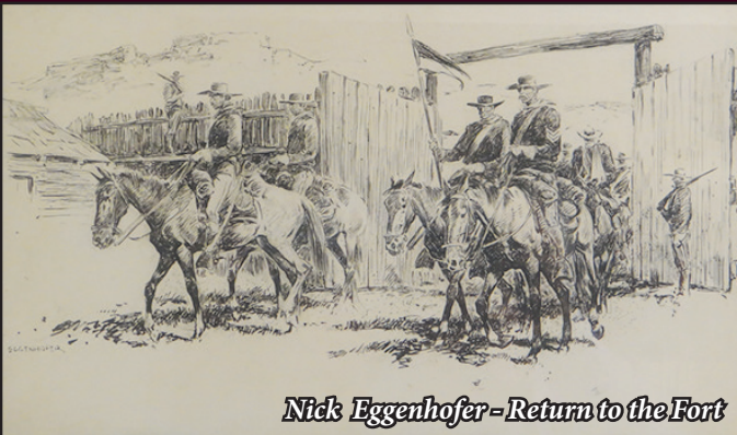
Nick Eggenhofer - Return to the Fort

WESTERN ART • BRONZES • COLLECTIBLES WESTERN GEAR • FIREARMS