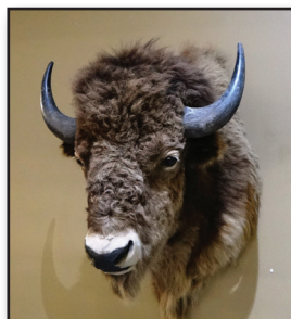
American Bison Mount