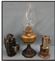
Oil & RR Lamps