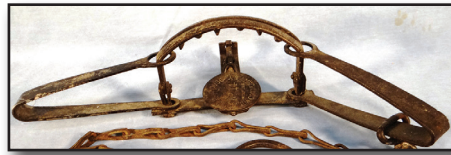
Newhouse #14 Wolf Trap