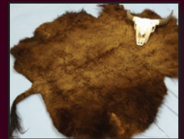
Buffalo Rug & Skull