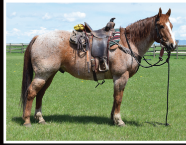
Turbo - 8 y.o. QH Geld Rides - Packs - Good using horse