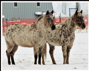
7 & 9 y.o. Pony Mares Full sisters - Well broke