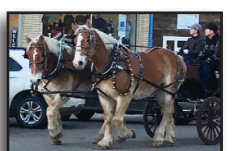
8 & 9 y.o. Belg Gelds well broke - Seasoned