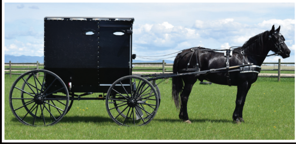
Dillon - 6 y.o. Morgan x Perch Geld Rides - Drives single & double - Well broke

at the Reuben Miller Farm, 3 miles SE of Moore, MT