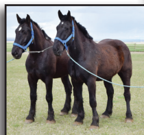
Duke & Doc