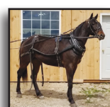
Standardbred Geld Nice mover