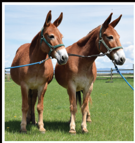
Maude & Millie - 9 & 10 y.o. Molly Mules Very well broke