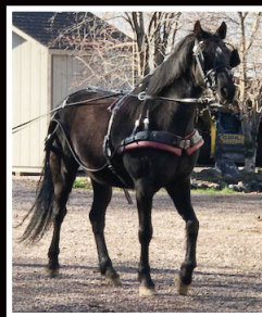
Flare - 10 y.o. Morgan Geld Drives - Rides - Quiet