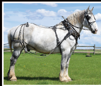
Prince - 15 y.o. Perch Geld Drives - Rides - Very classy