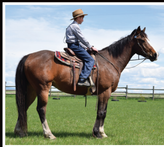
Coco - 6 y.o. QH Geld Rides - Packs - Very quiet