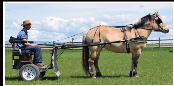
Emma - 13 y.o. Fjord Mare Rides - Packs - Drive single & double