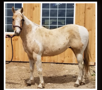
10 y.o. Paint x QH Geld Well broke all around horse