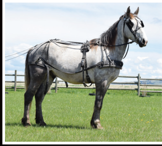
AJ - 4 y.o. Perch X Geld Drives - Rides - Very quiet