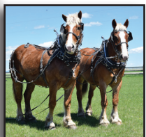
Bruce & Bud