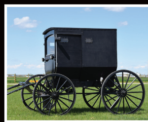
Single Seat Buggy