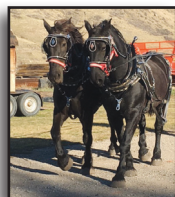
Bic & Bob