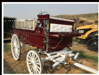
Fancy Hitch Wagon