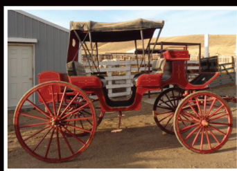
Vis a Vis