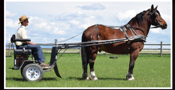
Clyde - 8 y.o. Draft X Geld Rides - Packs - Drive