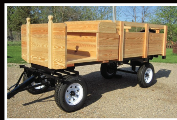
10' People Hauler