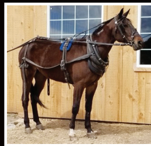
Standardbred Geld All trot