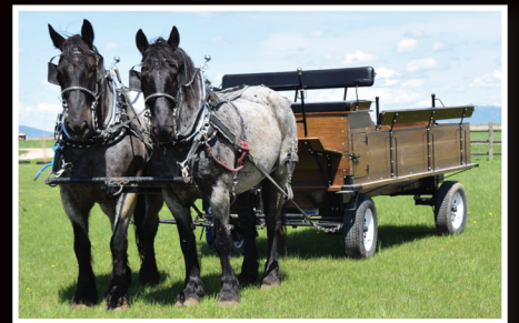
Bill & Blue - 10 y.o. Perch Gelds Very well broke - Beautifully matched