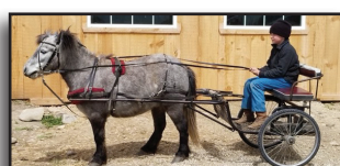
9 y.o. Pony Geld Well broke - Rides & Drives

Shobe Auction Office - 406-538-5125 Jayson - 406-366-5125 or jayson@shobeuction.com Kyle - 406-366-0472 or kyle@shobeuction.com www.ShobeAuction.com