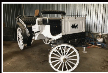
Vis a Vis Wedding Carriage